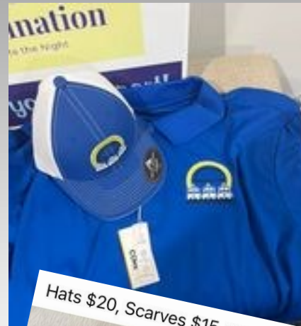
Hats $20, Scarves $15 or the set for $30.