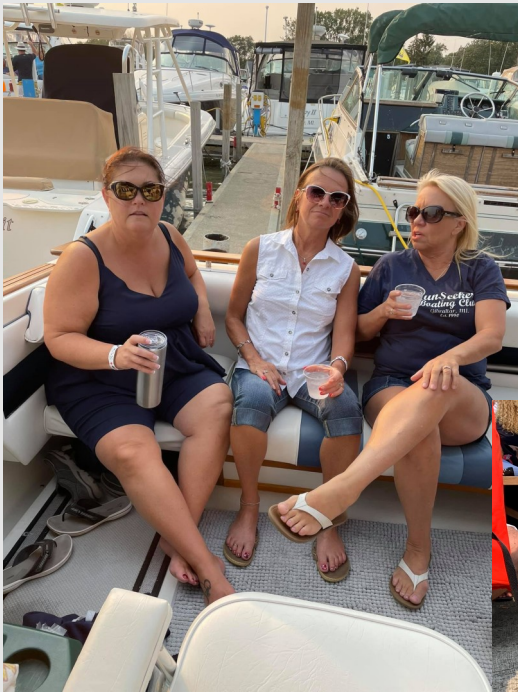
DBBC 2021 Regatta