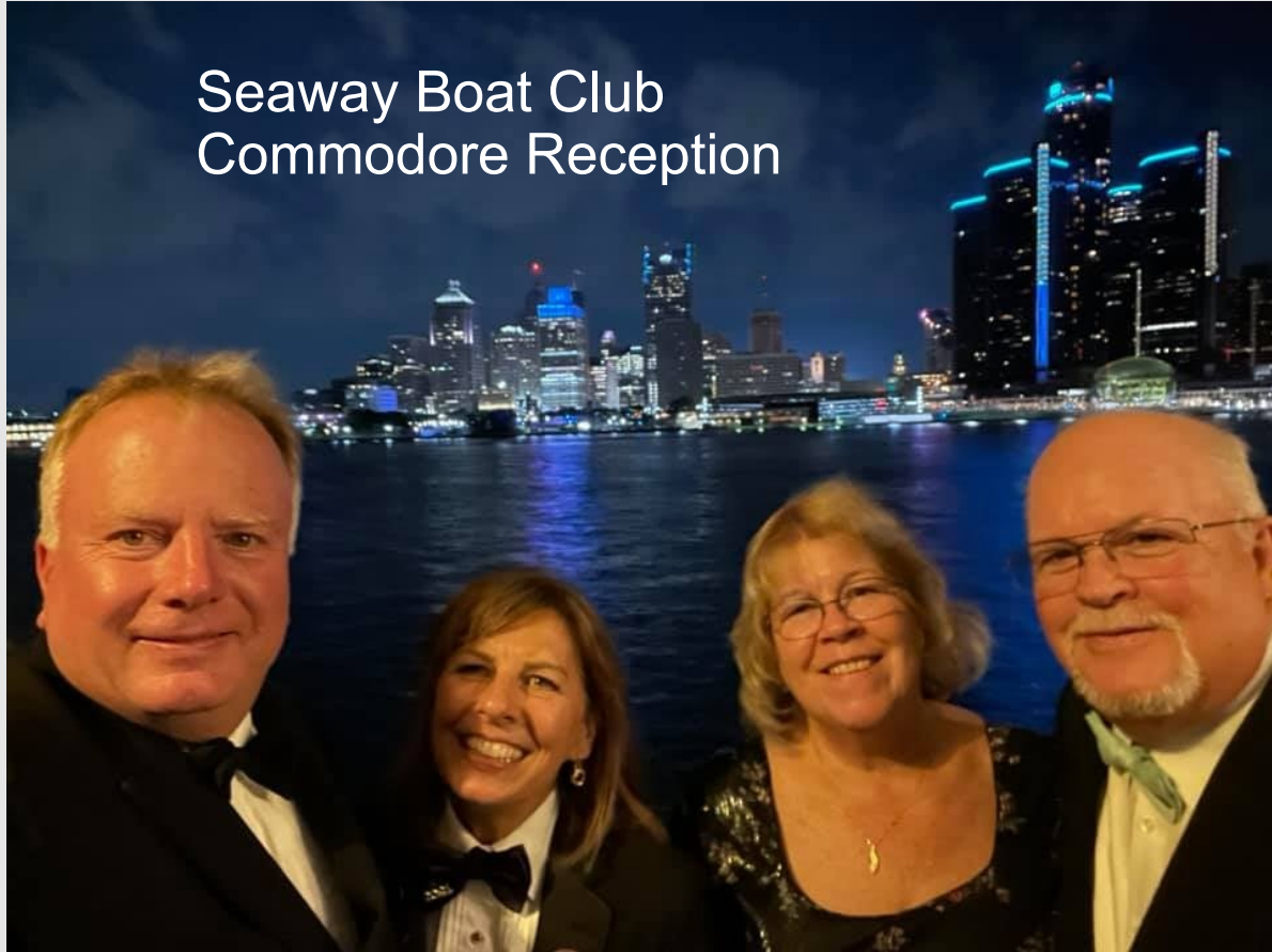
Seaway Boat Club Commodore Reception