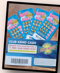
Club Keno and Pull Tabs are here!