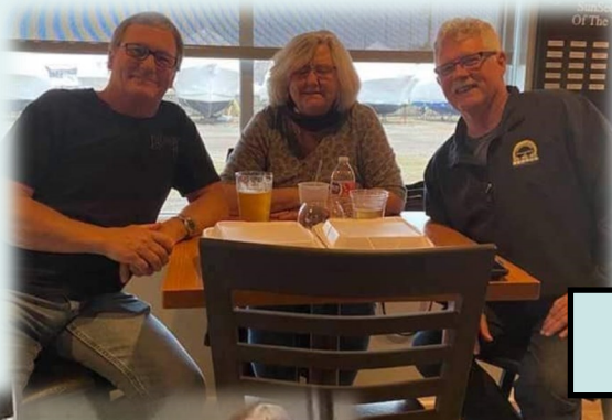
Name That Tune