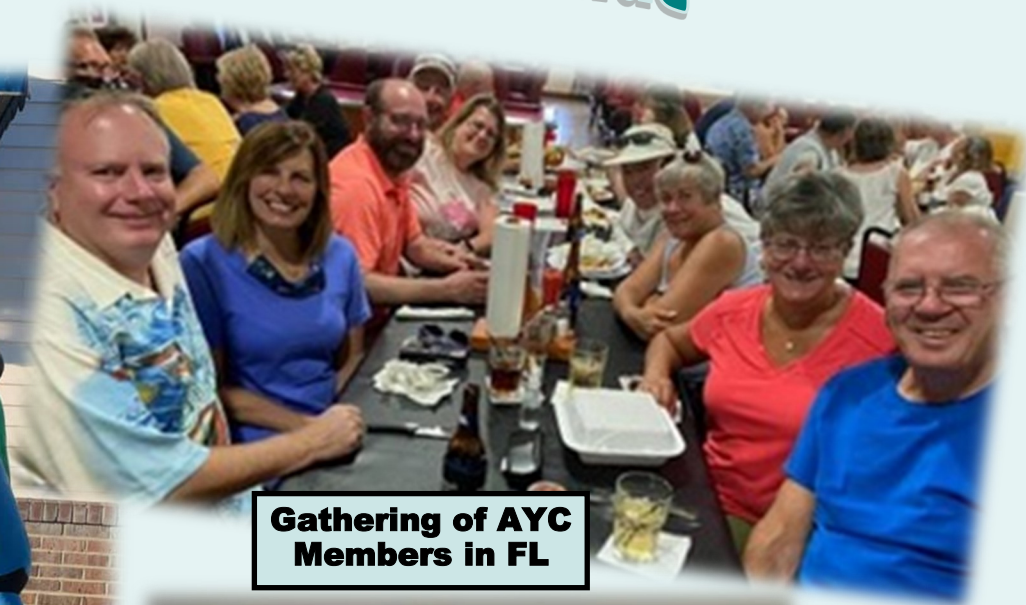
Gathering of AYC Members in FL