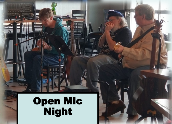
Open Mic Night