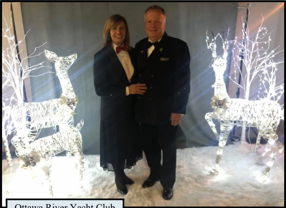
Ottawa River Yacht Club Commodore's Ball