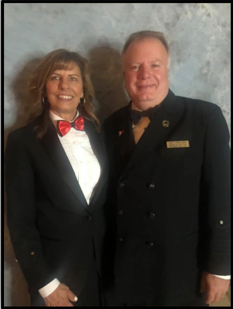
Point Place Boat Club Commodore's Ball