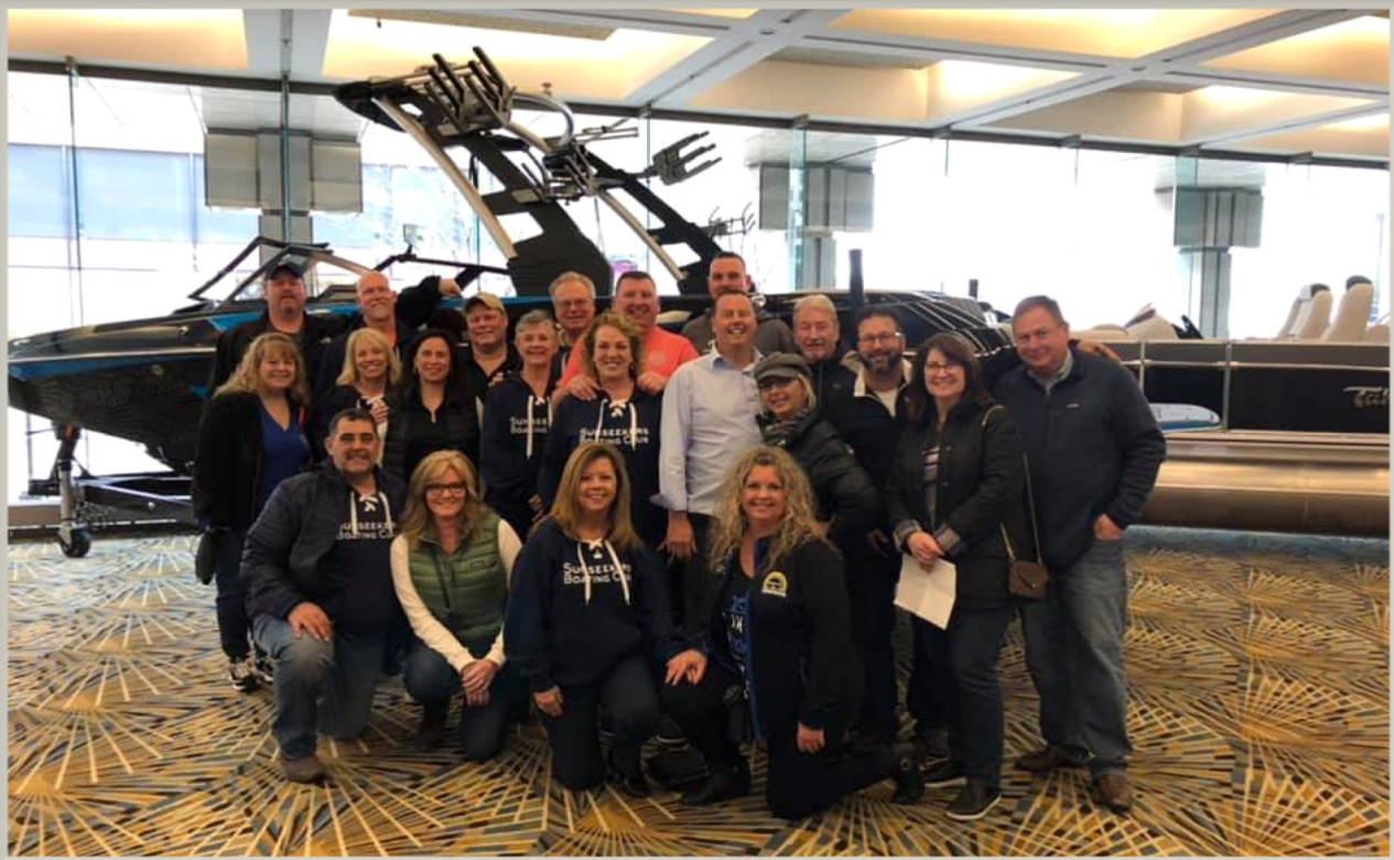
SSBC Bus Trip to the Detroit Boat Show