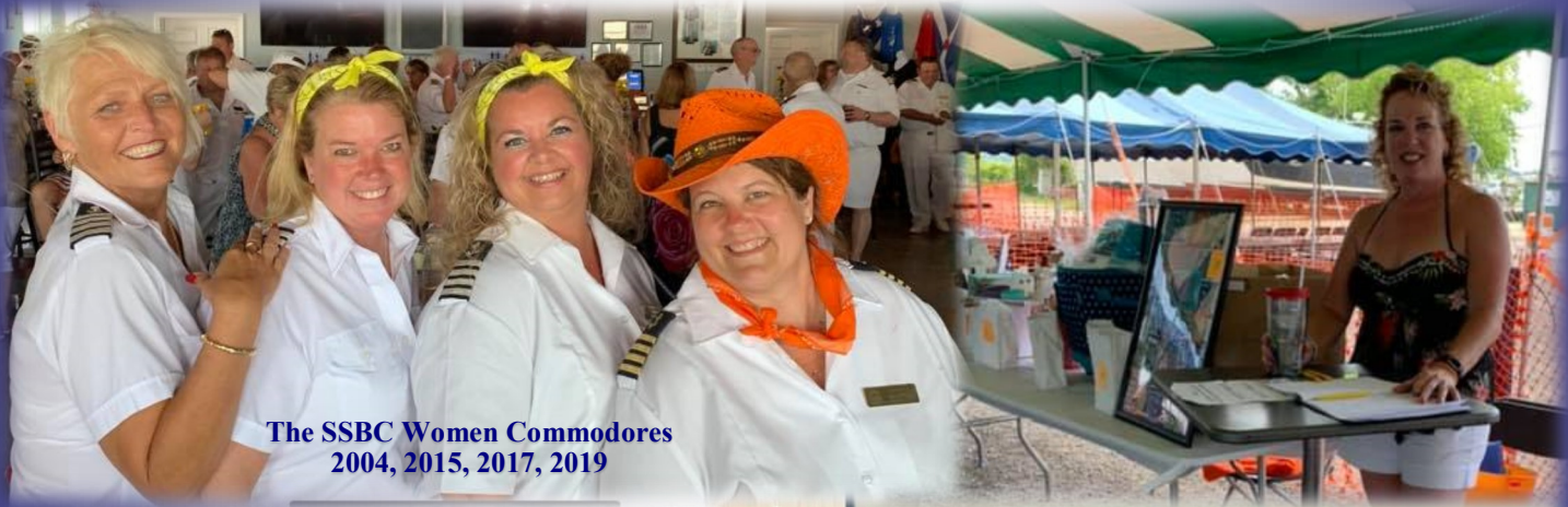
The SSBC Women Commodores 2004, 2015, 2017, 2019