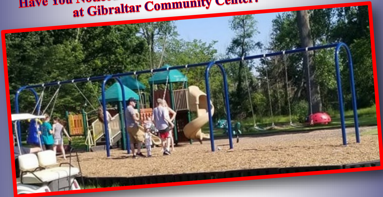
Thanks to the generous donation from Sunseeker's Boating Club and Rotary Club of Gibraltar

Have You Noticed the New Playground Equipment at Gibraltar Community Center?