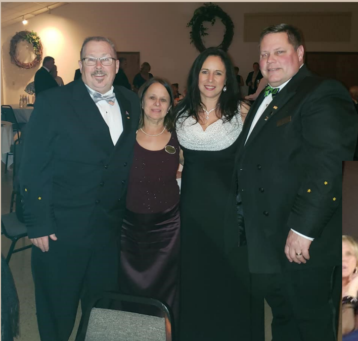
Point Place Boat Club Commodore's Ball