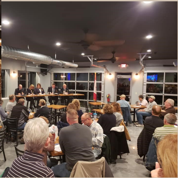
First Meeting at the New Club