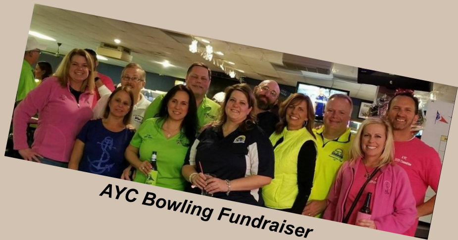
AYC Bowling Fundraiser