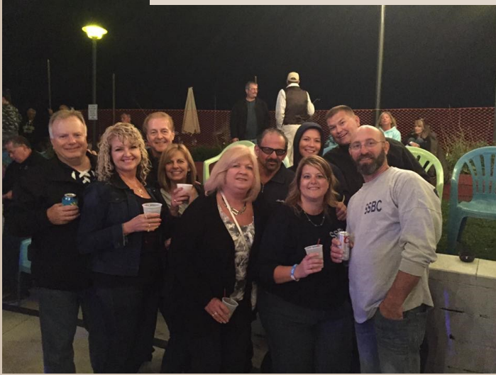
Detroit Beach Boat Club's Regatta