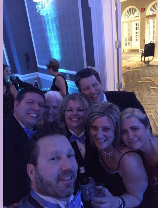
Ford Yacht Club