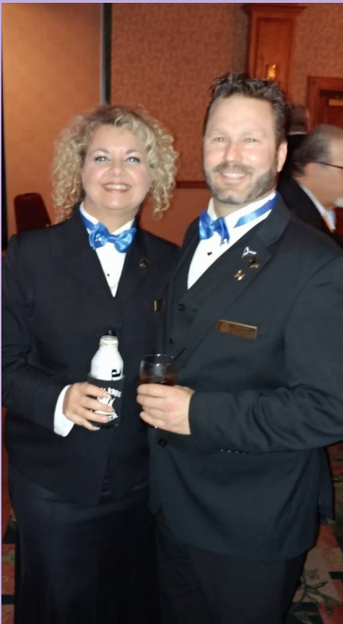
Great Lakes Steel Ball