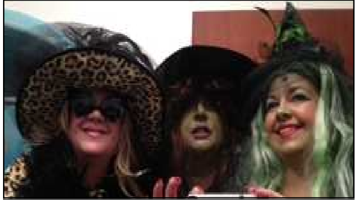
Here are some Witches enjoying Sunseeker's Halloween Party!