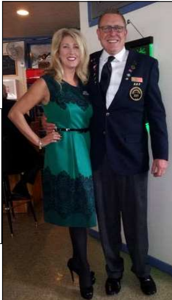
Sunseeker's Commodore and his beautiful Lady enjoying the Cocktail Party during Oktoberbest!