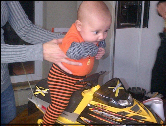
Here's a future Sunseeker getting ready to tackle the cold winter months with some fun in the snow!!!